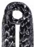
Black Caviar White Snow