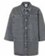
Washed Denim Grey