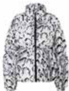
AOP Serpentsis, white