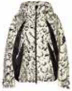
AOP Serpents, white