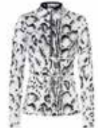
AOP Serpents, white