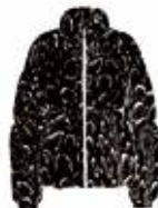
AOP Serpentsis, black