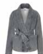
Washed Denim Grey