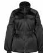
Black Caviar hammer