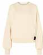
FADE DYE White Cloud, heavy