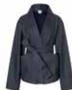
Dark Denim Blue