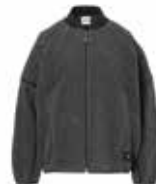
Cielo melange Dark Anthracite