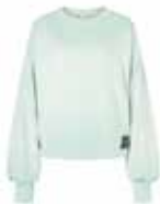
FADE DYE MINT, lightweight