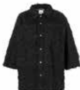
Deep Black „open slub“