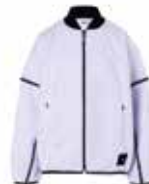
Stern, Lavender Hush GARMENT DYE