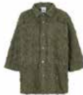
Sage Green, „open slub“