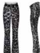
AOP Serpentsis, black