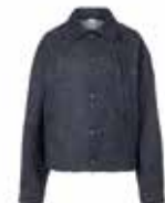
Dark Denim Blue