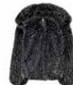
Fake Fur [silver fox]