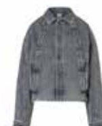
Washed Denim Grey