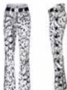
AOP Serpentsis, white