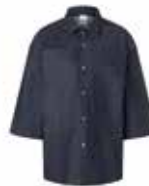
Dark Denim Blue