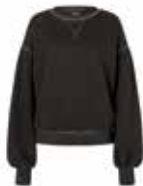
FADE DYE BLACK, heavy