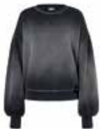
FADE DYE BLACK, lightweight