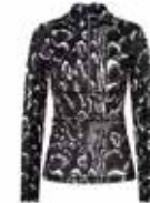
AOP Serpents, black